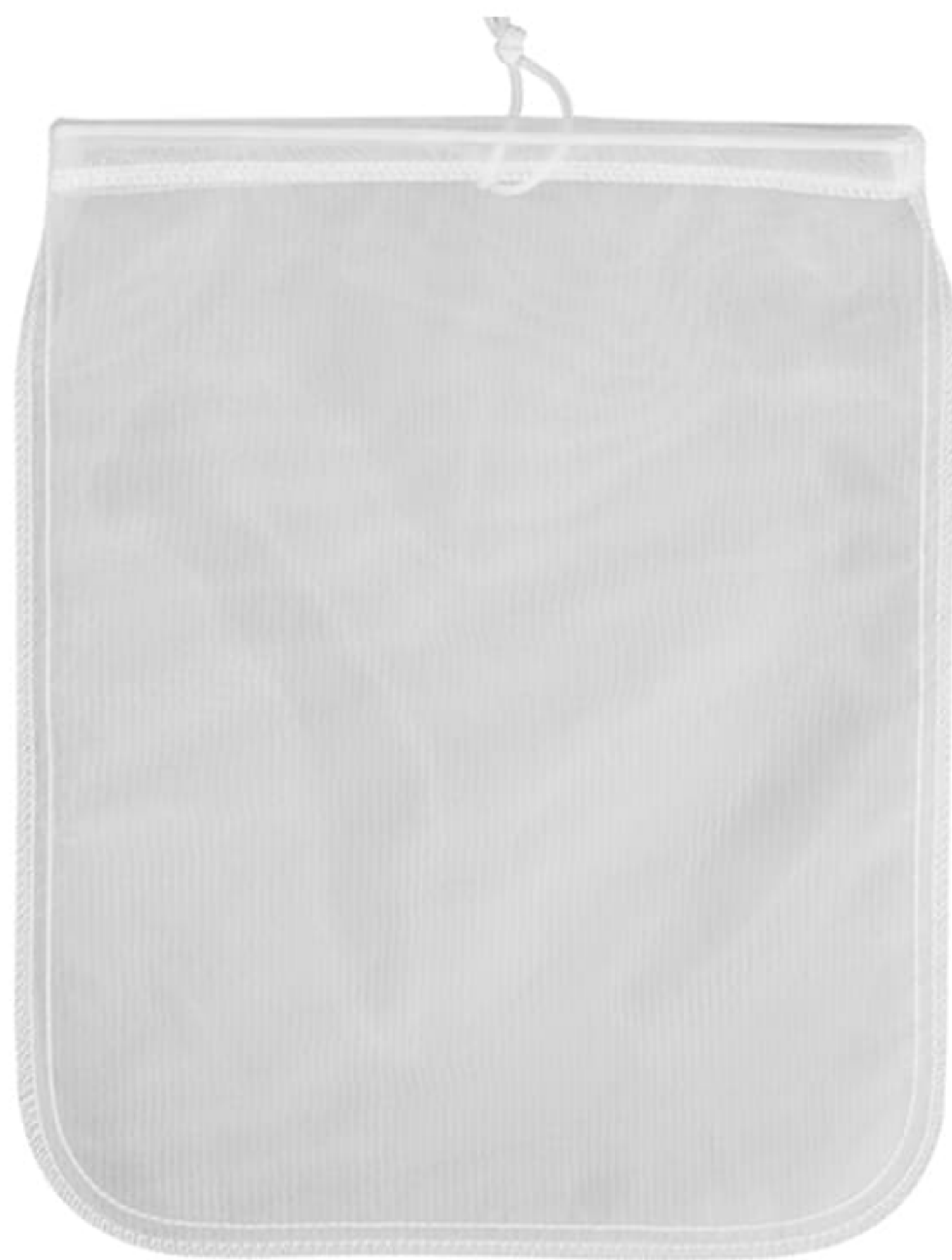
Nylon Nut Milk Bag 1.Food Grade Nylon Mesh 2. BPA Free Certified 3.Most Popular Material 4.Easy To Clean 5.Reusable & Durable 6.Do Not Absorb Water, Easy To Dry 7.Especially Smooth 8.Multiple Uses 9.Practical And Easy To Use