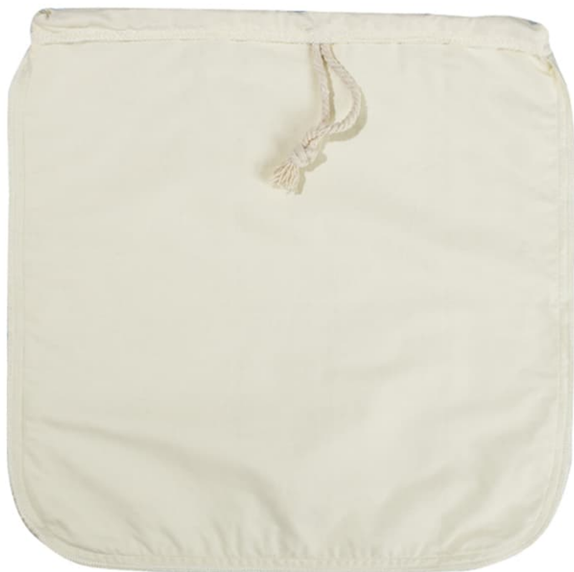
Hemp Nut Milk Bag 1. 100% Nature Hemp 2.BPA Free 3.Organic And Unbleached 4.High Temperature Resistance 5.Reusable & Durable 6.Practical And Easy To Use 7.Easy To Degrade, Reduced Pollution 8.Natural Fiber, Good For The Environment