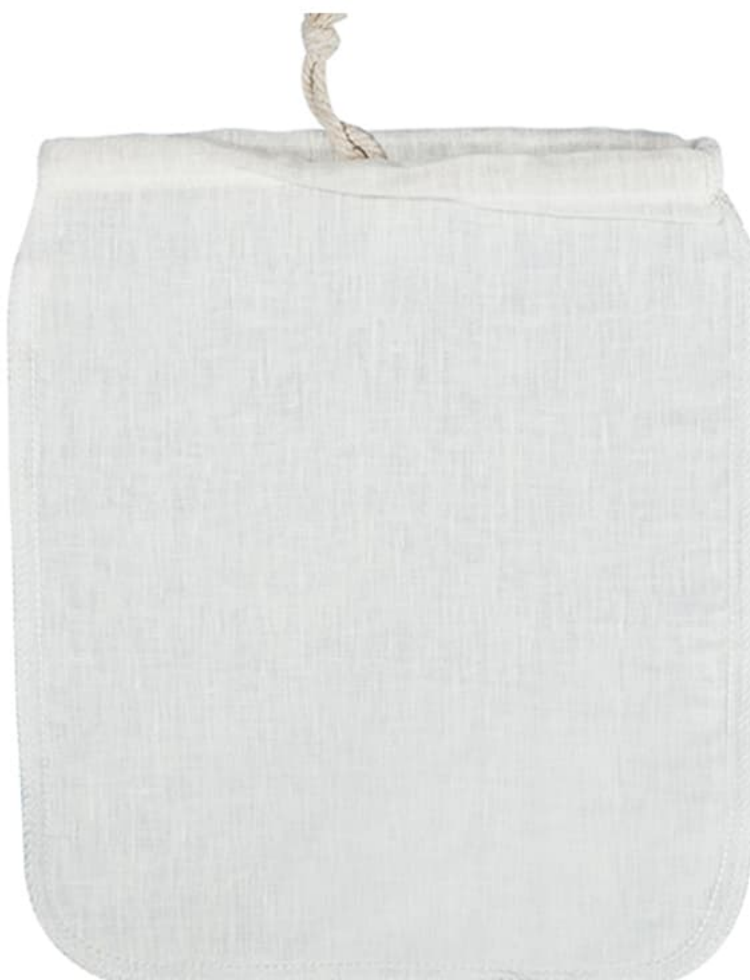
Cotton Nut Milk Bag 1. 100% Nature Cotton 2.BPA Free 3.Organic And Unbleached 4.High Temperature Resistance 5.Reusable & Durable 6.Practical And Easy To Use 7.Easy To Degrade, Reduced Pollution 8.Natural Fiber, Good For The Environment